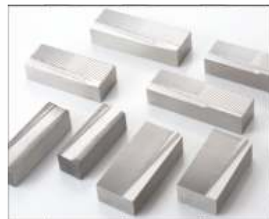
Thread Rolling Dies