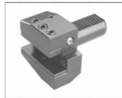
VDI Tool Holder Serration