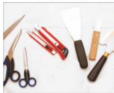
Scissor, Cutter, Knife